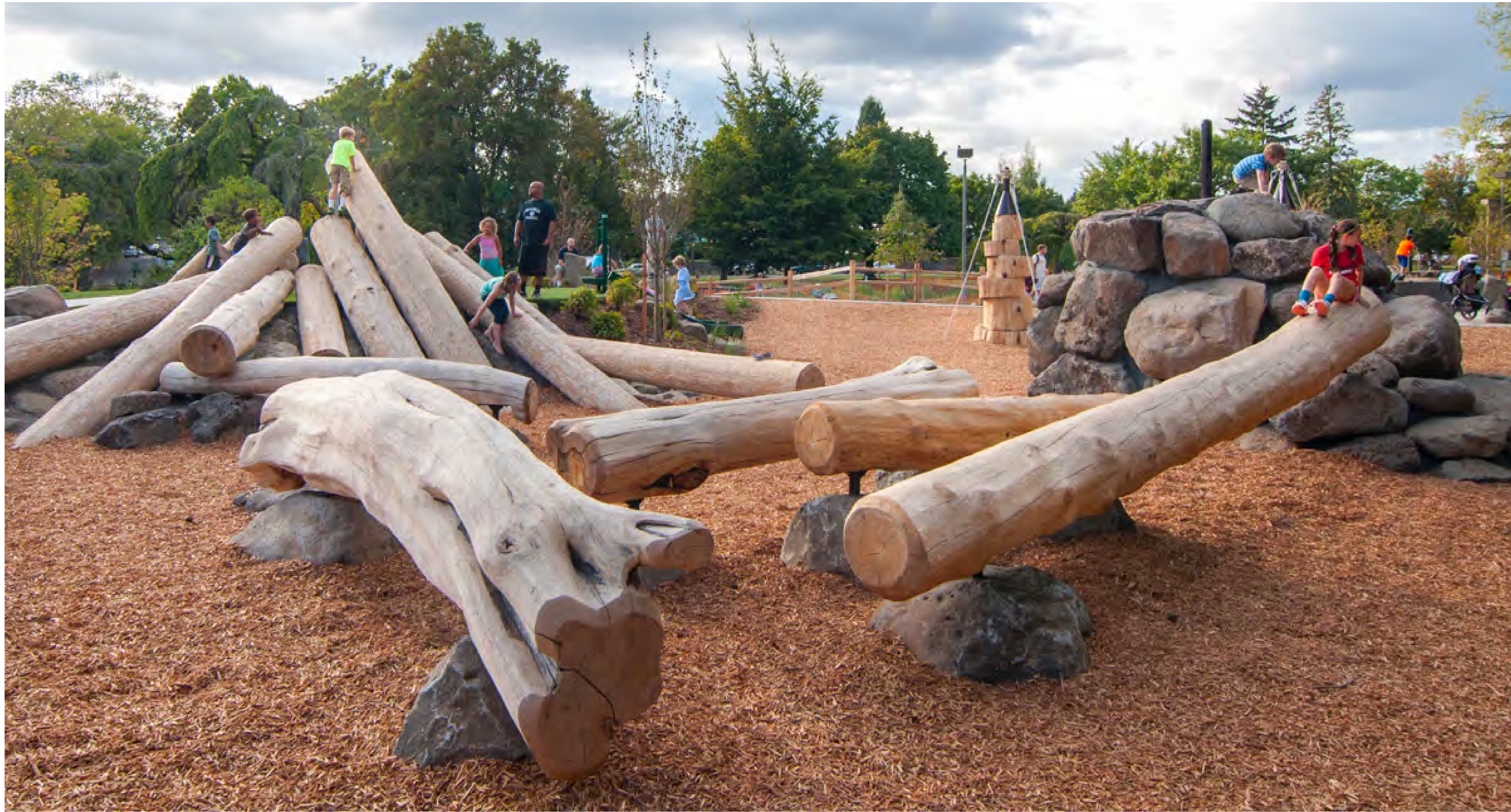
BERTHOUD RESERVOIR NATURE PLAY + HILL SLIDE