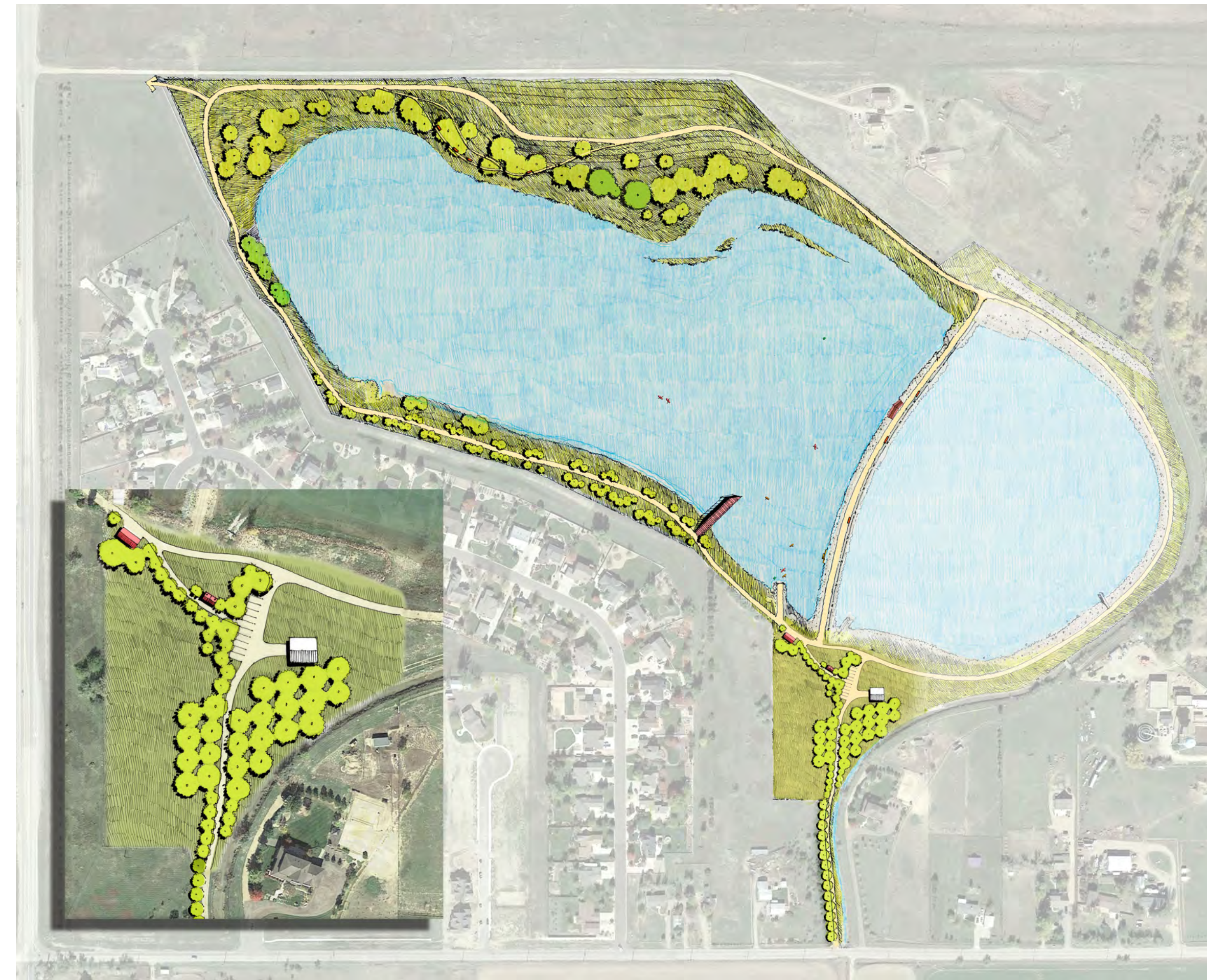
PROGRAM CONCEPT B IMPROVED VEGETATION