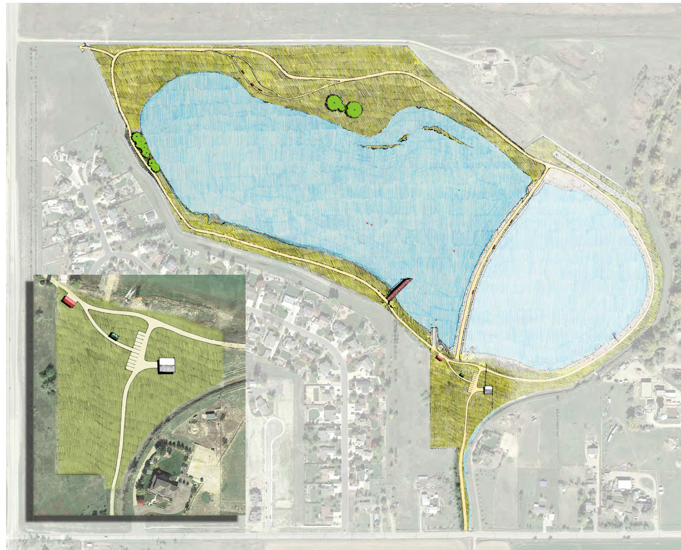
PROGRAM CONCEPT A MINIMAL IMPACT