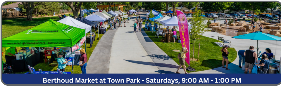
Berthoud Market at Town Park - Saturdays, 9:00 AM - 1:00 PM